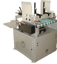
KR500 - Friction Feeder

With 3 feed modes and compatible with product up to 18" wide, this is one of our most dependable friction feeders.