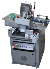
KR497BW - Servo Friction Feeder

This is a larger version of our popular friction feeder. It can handle a large variety of products from envelopes to posters.