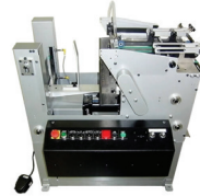
KR502N - Napkin Feeder

An affordable industrial feeder designed to feed flat, die-cut boxes and other difficult products.