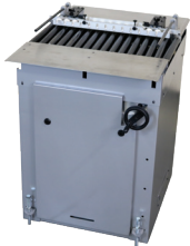
KR840R - Roller Registration

Accurately register a wide range of product, with right or left justification options.