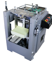
KR503 - Friction Pile Feeder

Offers a consistent feed for difficult products with fully adjustable guides.