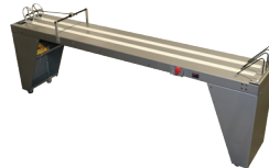
KR314 - Shingle Conveyor

Available in 4, 6, 8, 10, and 12 foot lengths.