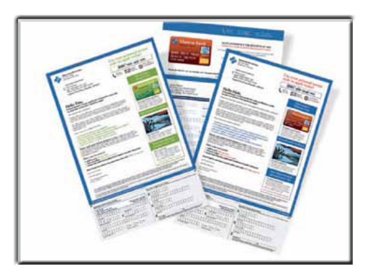
Increase promotional effectiveness and response rates with high-speed, high-quality variable color added to envelopes and web-printed pages.