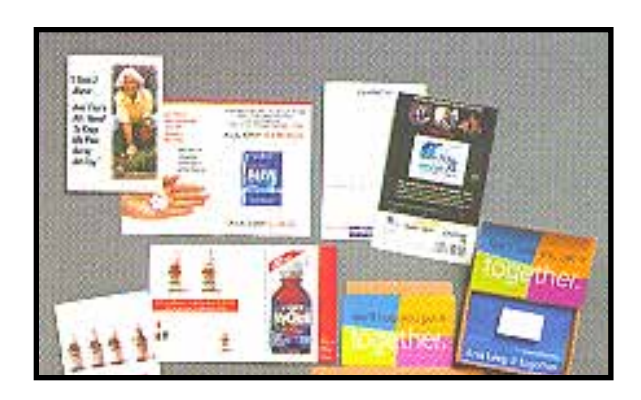
Samples produced by the 203P