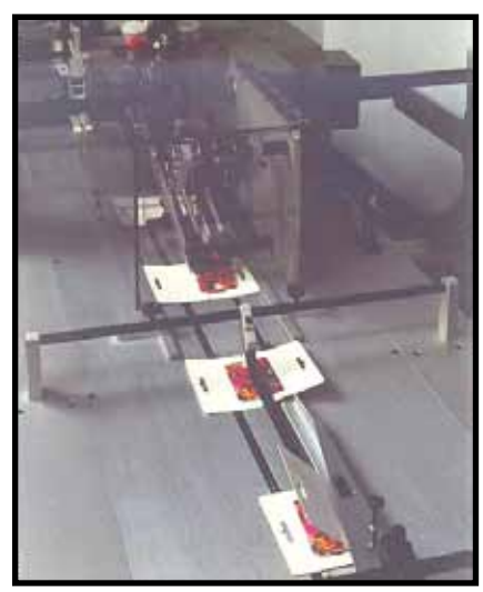
Optional plow fold stations and other customized solutions means increased versatility.