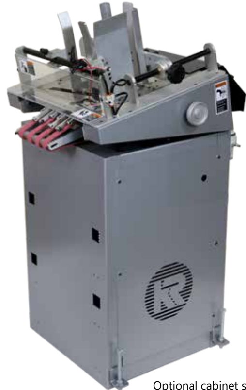
Optional cabinet stand