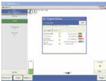
Manage and load jobs