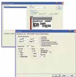
Design print template

The management software runs on the user interface and provides printer configuration, control and monitoring. The interface allows the user to monitor a wide variety of operating conditions, including job types, counts, and ink usage, all in real-time.